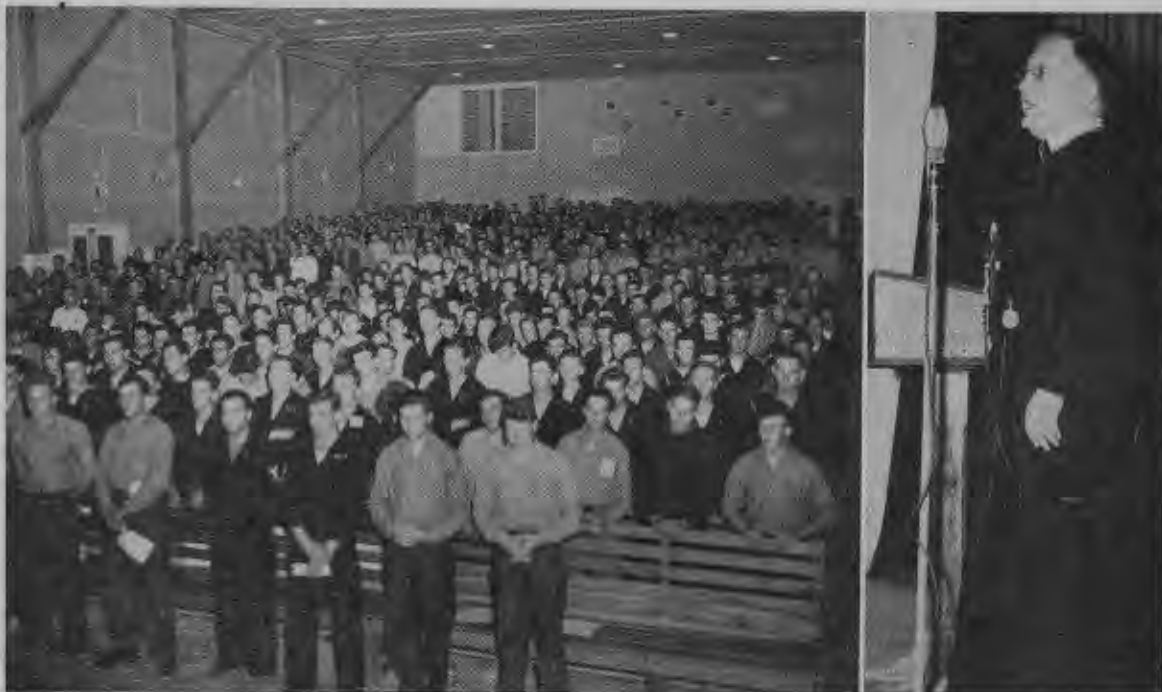
Catholic servicemen thronged the Gulbranson Hall auditorium that likewise does duty as chapel, to attend the recent mission services, as photo at left