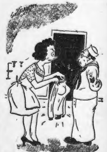
"ARE YOU SURE YOU BOUGHT THIS SWEATER AT SMALL STORES?"

C P O CLUB Thursday 2030 SCHUBERT, MELODY MASTER