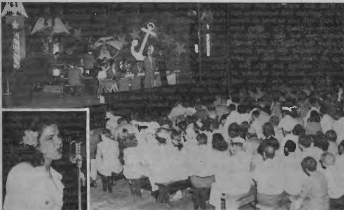
Ted Fio Rito and his orchestra entertained at the V-J Day celebration at Jaycee Field in another of W&R's "Music Under the Stars" programs. An over-all shot of the band and enthusiastic crowd is shown above; while lower left, one of the lovely