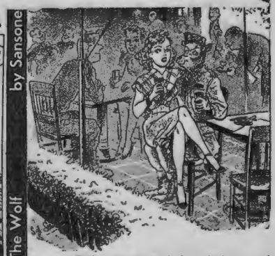
Tell me more about Charlie McCarthy!